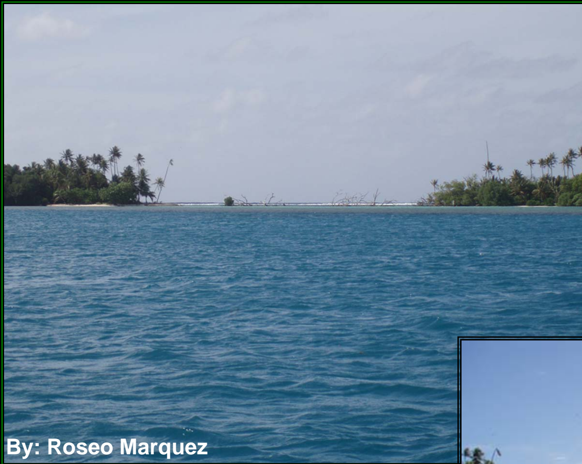
By: Roseo Marquez

- Our lifestyle depend on the sea and land resources, but these are in the front of CC Impacts