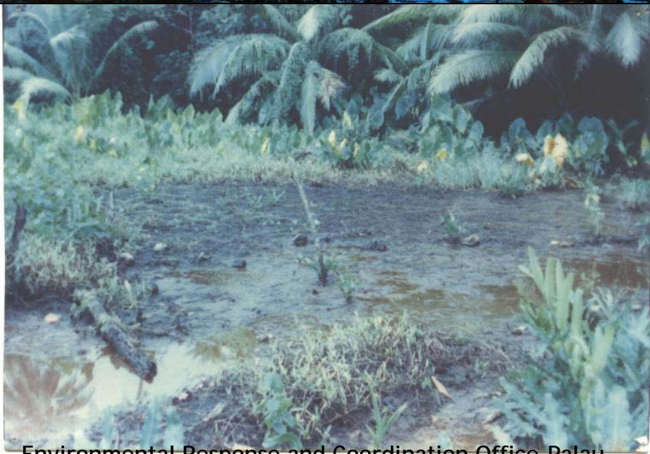
Environmental Response and Coordination Office-Palau