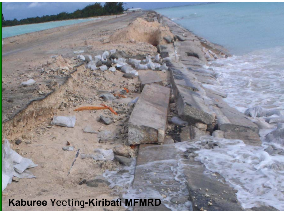
Kaburee Yeeting-Kiribati MFMRD